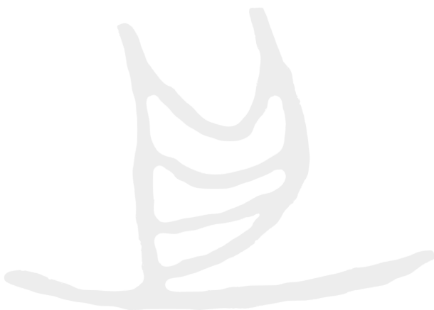
wa`a kaukai (Single Hull Canoe)